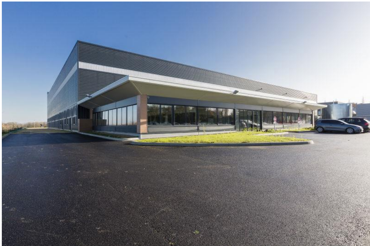
Head Office and Logistics Platform Venteo