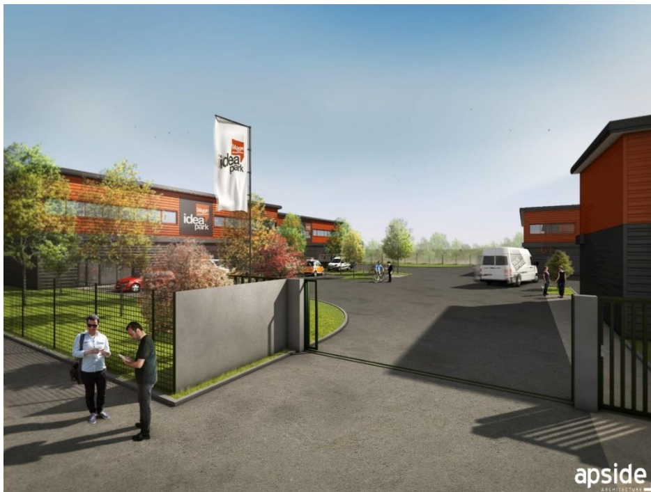
The Idea'park Concept